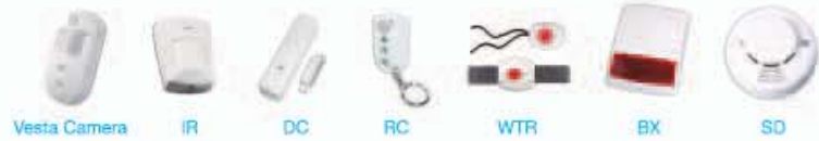
Vesta Camera IR DC RC WTR BX SD