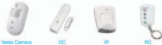
Vesta Camera DC IR RC