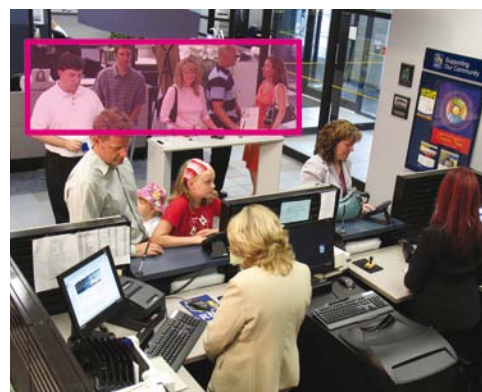
Queue Length Monitoring