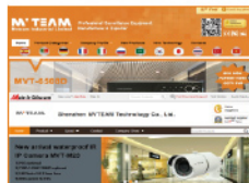
7-Year Golden Supplier