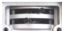
External Zoom & Focus