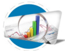
[Analytics + Reporting]