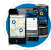
[Smart App Tracking]