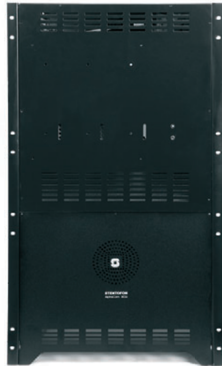
6 UNIT HIGH AUDIO SERVER SUPPORTS 2-552 IP STATIONS AND 102 ANALOG STATIONS