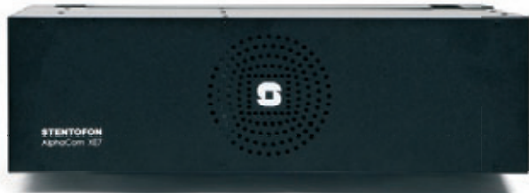
3 UNIT HIGH AUDIO SERVER SUPPORTS 2-552 IP STATIONS AND 36 ANALOG STATIONS