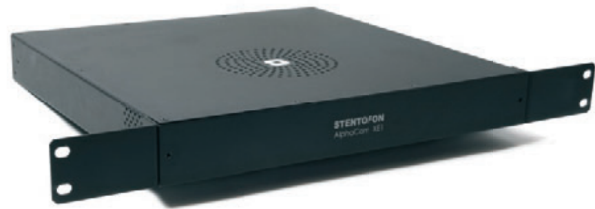
1 UNIT HIGH AUDIO SERVER SUPPORTS 2-552 IP STATIONS