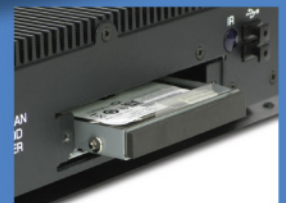
Removable / Anti-vibration HDD design