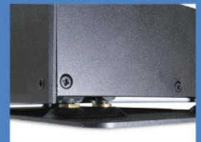
Anti-vibration / Anti-shock system design