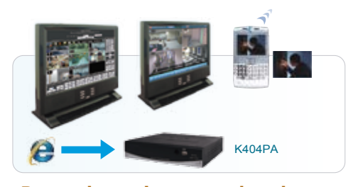
Remotely monitor, control, and playback via the internet.