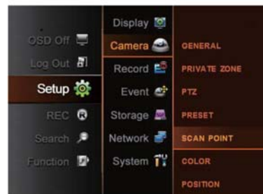
Friendly User Interface