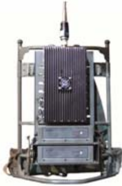
MV2000TBH/MV2025TBH Backpack Transmitter