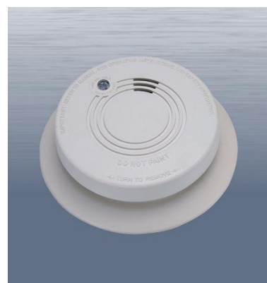
Model : AK-218A