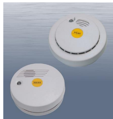
Model : AK-218A3/A4