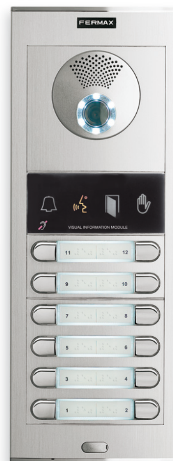
Video door entry panel with OneToOne module and braille labels.