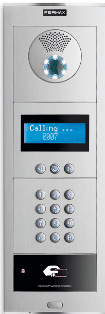
Digital video door entry panel with proximity reader