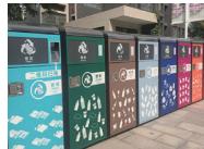
Smart Environmental Protection