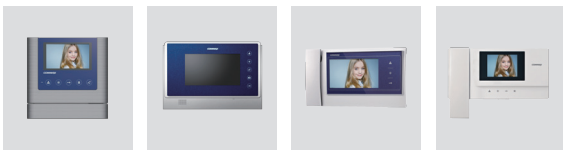
MONITOR CDV-43M MONITOR CDV-70U MONITOR CDV-70K/70KM MONITOR CDV-35A