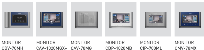
MONITOR CDV-70MH MONITOR CAV-1020MGX+ MONITOR CAV-70MG MONITOR CDP-1020MB MONITOR CIP-700ML MONITOR CMV-70MX