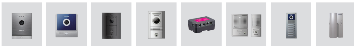
DOOR CAMERA DRC-4M