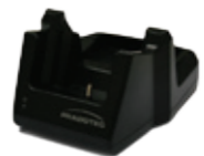
Device and Battery Charging Cradle