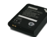
3600 mAh Battery