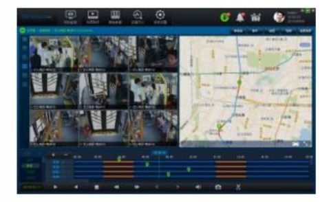
Analysis and Playback