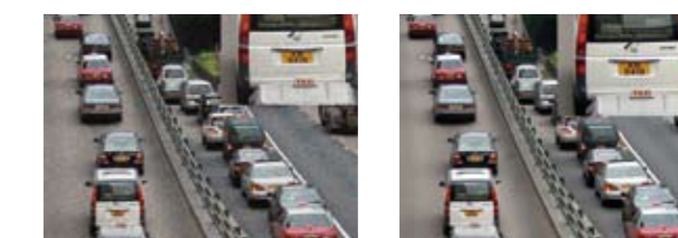
Conventional Camera Surveon's Network Camera

Optimizations in optical engineering—in both image processing and codec integration—provide Surveon network cameras with ideal image clarity and low light sensitivity. Advanced components such as day/night ICRs, IR LEDs, WDR and low-light image sensors, and ISP controls ensure the cameras suitability for various color and lighting combinations.