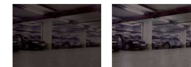
Conventional Camera Surveon's Network Camera