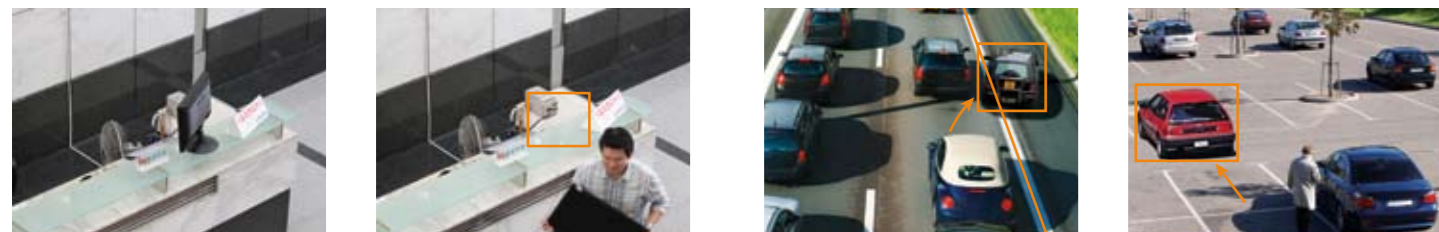
Original Scene Missing Object Detected Intrusion Detection Forbidden Area

All Surveon network cameras support real-time VI with the Surveon VI Suite, featuring functions such as foreign and missing object detection, forbidden area, intrusion detection and camera tampering detection. These real-time video analytics help increase the situational awareness of monitoring personnel, and increase surveillance efficiency.